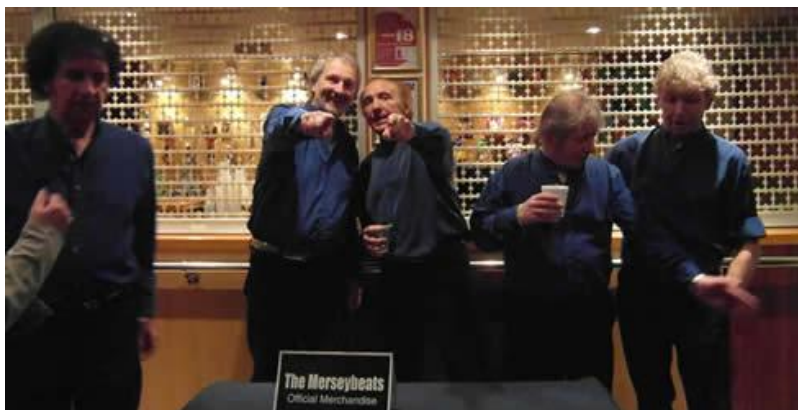
"Signing autographs & time for beverages "